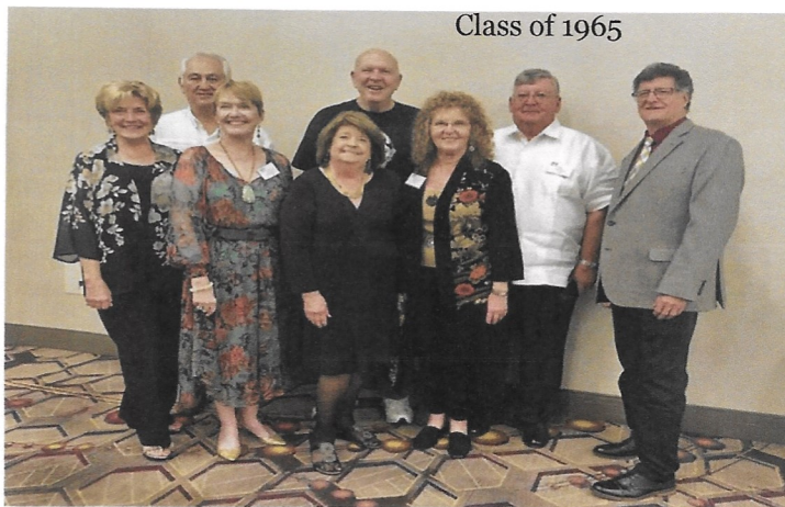
Class of 1965

IAA is an Association that was established in 1987 by many dedicated members past and present. The only way we can survive the future is younger Alumni taking an active part in the Association, i.e , Officers of the Association and Reunion Committees, Newsletter Staff. I know many are retiring now and may want to devote some of their spare time to help continue this Association. Just ask and no one will be offended that you have volunteered, as we all share a unique experience in life...ITAZUKE.